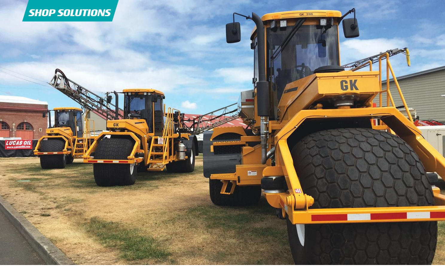
The GK 3W6 Sprayer was featured at the Oregon State Fair. It has been updated with a more fuel-efficient engine and 200 percent stronger frame.